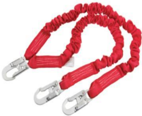
1340141 – Pro Stretch 100% Tie-Off Shock Absorbing Lanyard

Capital Safety is aware of a reported inadvertent disconnection during use of the locking snaphook used in a series of Y-shaped Protecta lanyards with twin elastic lanyard legs that both attach directly to the eye of the snaphook. The locking snaphook used on these lanyards is part number 9502573. The affected products are: