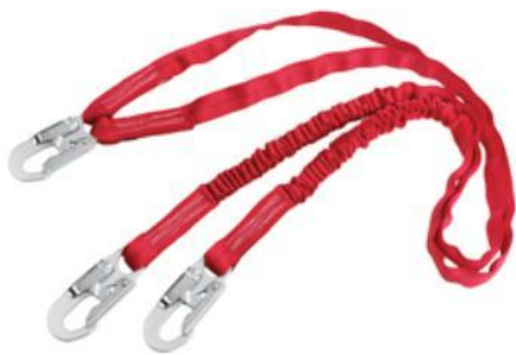
1340240 – Pro-Stop 100% Tie-Off Shock Absorbing Lanyard