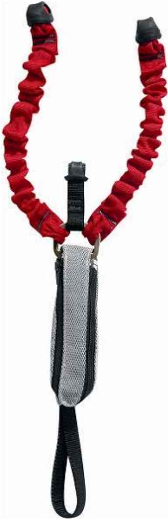
SCORPIO L60 2005 to Present