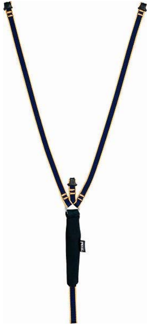
SCORPIO L60 2002 to 2005